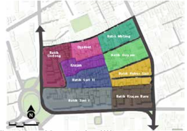
Figure 1: Research Location

The research location is in Kampong Batik Semarang in Rejomulyo Village, East Semarang District, Semarang City. The research location has an area of about 8.43 ha. Kampong Batik Semarang has 9 blocks consisting of: Kampong Batik Gedong, Djadoel, Batik Malang, Batik Gayam, Batik Kubur Sari, Batik Krajan Baru, Batik Sari I, Batik Sari II, and Krajan (See Figure I). Activities at Kampong Batik Semarang include: education on batik making, taking pictures with existing murals, and buying batik.